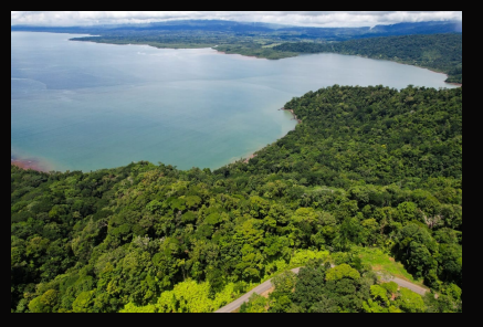
Enjoy the sight of humpback whales breaching in the Gulf twice a year and the yearly migration of schools of whale sharks that arrive in April to birth their young.