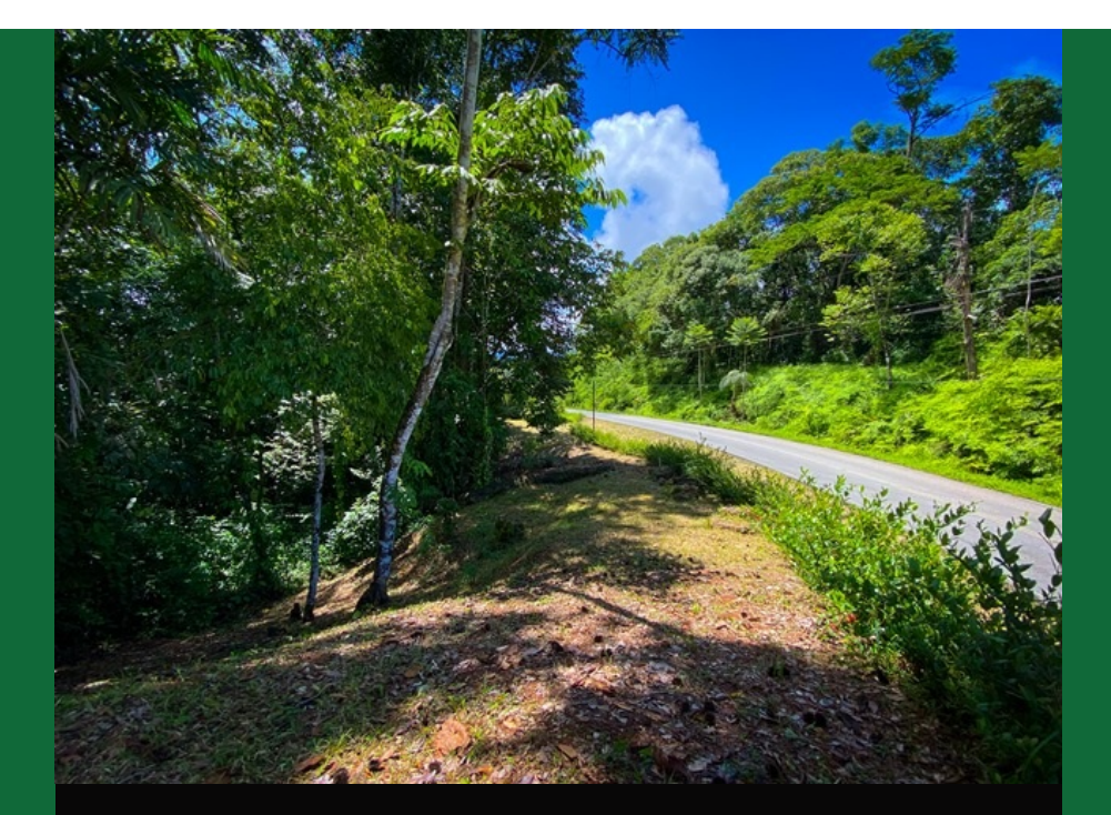
Now what about if I tell you this prime real estate is new to the market with an asking of only $250,000...?