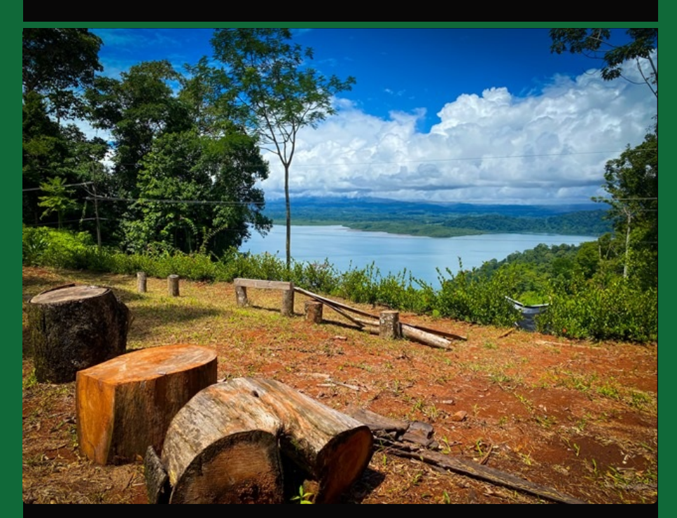
It's all true. The farm is 1 hectare in size and completely shovel ready for your development of a prime residential estate, commercial tourism facility, conservation, even segregation, whatever you want.